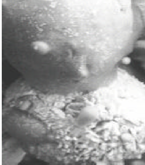
Figure 1. Molten clay ball (top) sticking to high iron ball.

Upon reporting this data, the customer asked if pond fines would be high in clay content. Yes, the culprit was identified independent of fuel analyses. Pond fines being blended in with the coal were creating large amounts of molten glassy particles that were causing excessive slag.