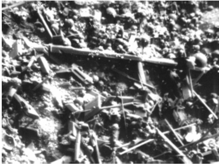
Figure 3. Crystals of CaSO 4 bonding flyash together.